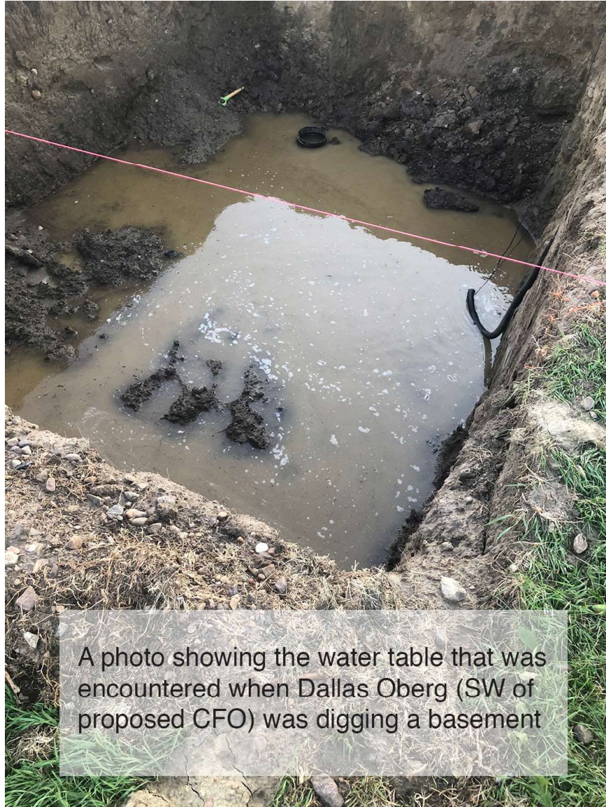
A photo showing the water table that was encountered when Dallas Oberg (SW of proposed CFO) was digging a basement